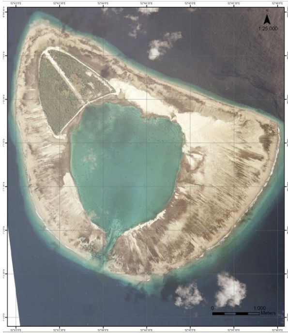
Figure 1. Aerial photo of Alphonse